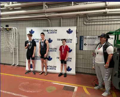
Kinsmen Mad Moto March 12, including Junior High and High School Provincials